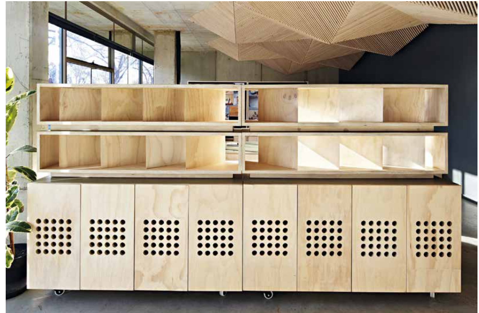
←← | Interior view ↑ | Custom-built furniture ← | Floor plan and schematic drawing